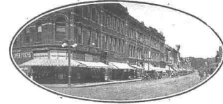
Main Street, Waterville

The Waterville Hotel List featured on the right was taken from a 1910 summer camp brochure and lists the room rage of The Hanford as $1.00-$1.25 per night or $3.50-$7.00 per week.